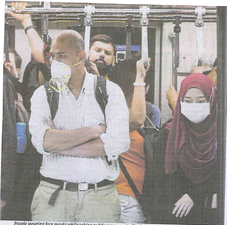
People wearing face masks while taking public transport in Kuala Lumpur yesterday.

The task force would be coordinated by the National Disaster Management Agency, together with the Foreign and Health Ministries.