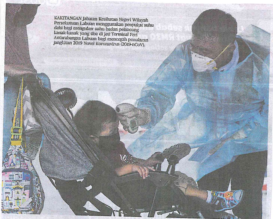
KAKITANGAN Jabatan Kesihatan Negeri Wilayah Persekutuan Labuan menggunakan penyukat suhu dahi bagi mengukur suhu badan pelancong kanak-kanak yang tiba di jeti Terminal Feri Antarabangsa Labuan bagi mencegah penularan jangkitan 2019 Novel Coronavirus (2019-nCoV).